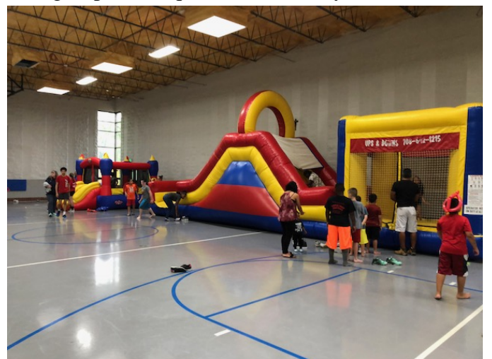
Fun with the bounce houses at Carmelite Festival II on July 21st .