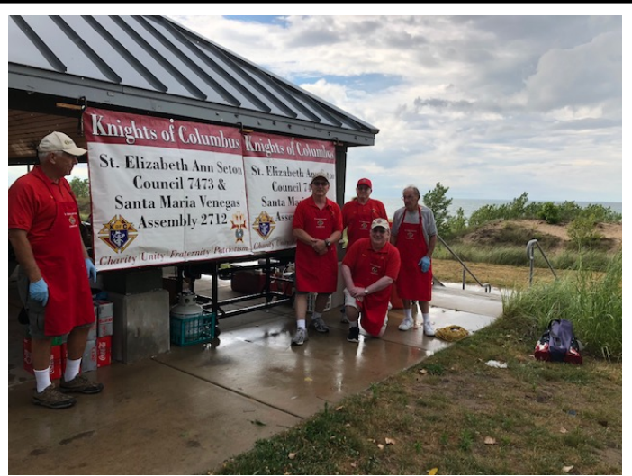
Cooking for the diocesan youth service group at Marquette Park on July 20th.